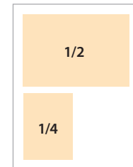
Half Page 7.25" x 4.75" Quarter Page* 3.5" x 4.75"