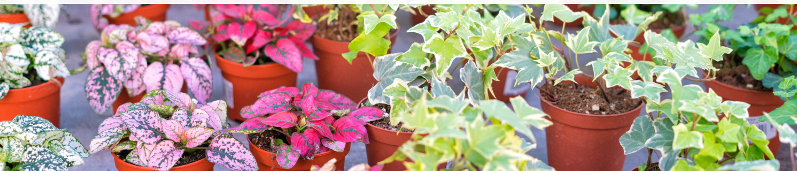
Quarter Page* 3.5" x 4.75"