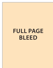
Full Page Bleed 8.5" x 11" +0.125" on all sides