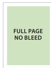
Full Page Non-Bleed 7.25" x 10"